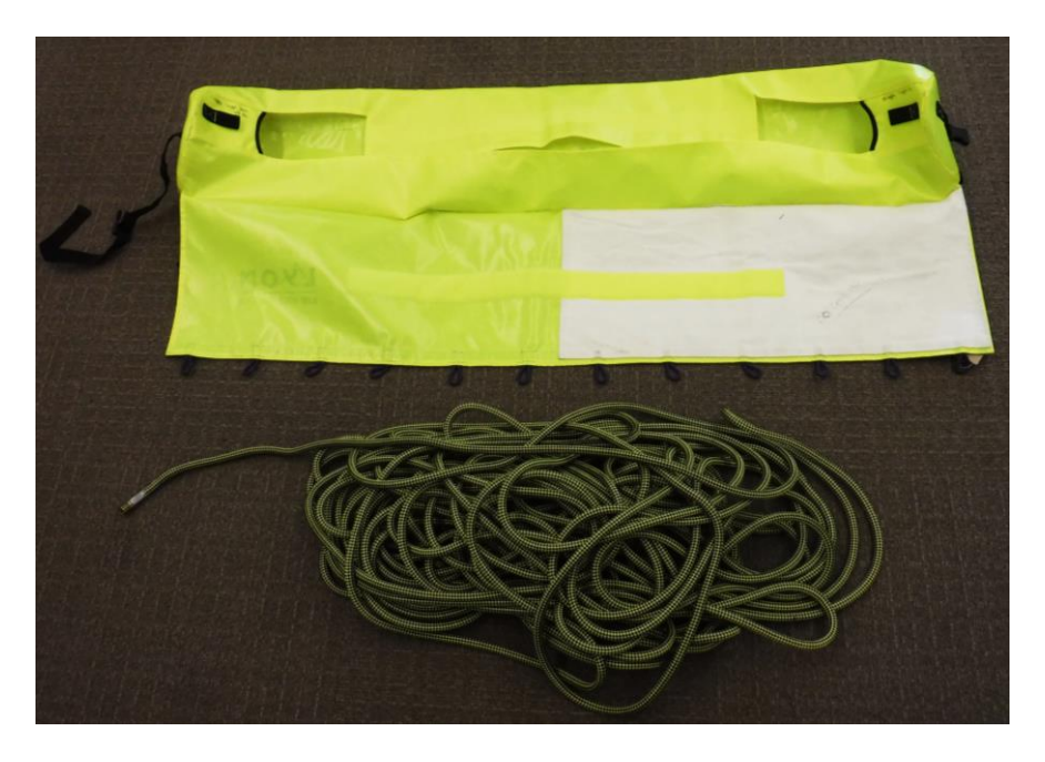
Open the bag and flake the inspected, clean, dry and untangled rope beside it

To ensure effective, tangle free deployment of the rope, the rope is packed into the Rapid Deployment Rope Bag in the following manner.