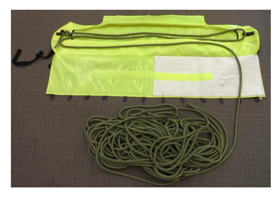
Run the rope from one end of the bag to the other, forming a loop at each end