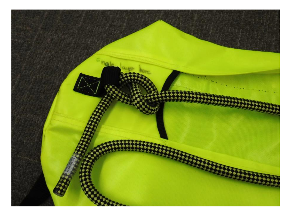
Tie the end of the rope to the small webbing loop. A Figure of eight knot is acceptable